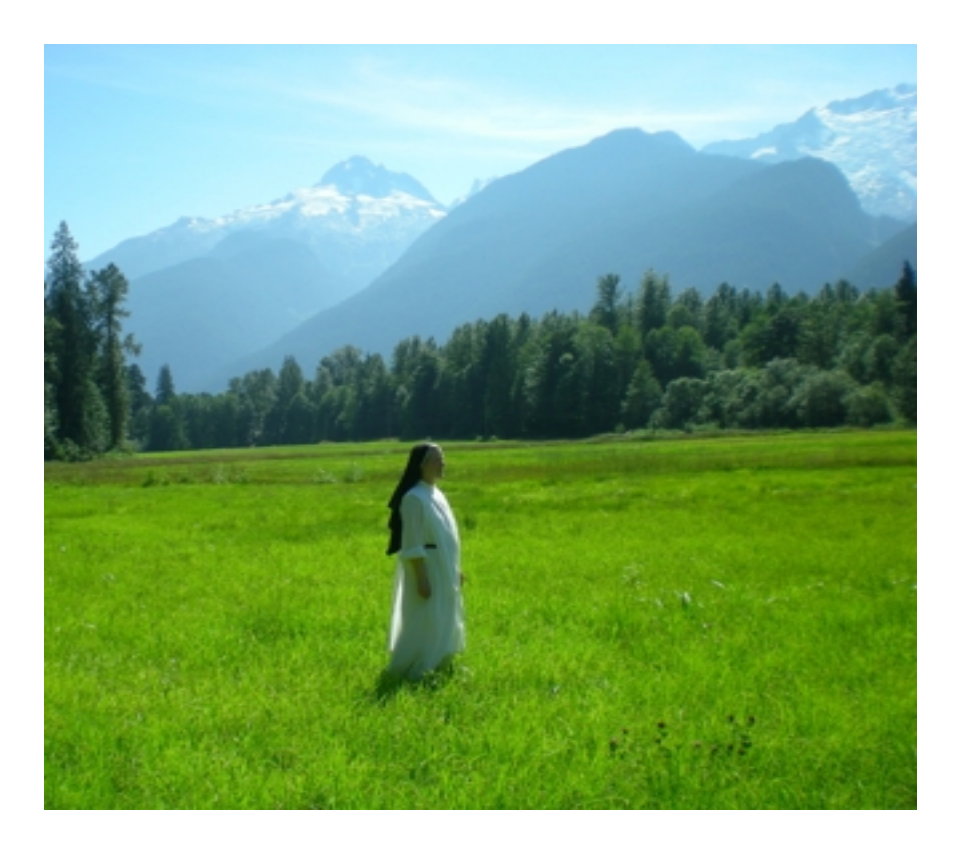
Queen of Peace Monastery